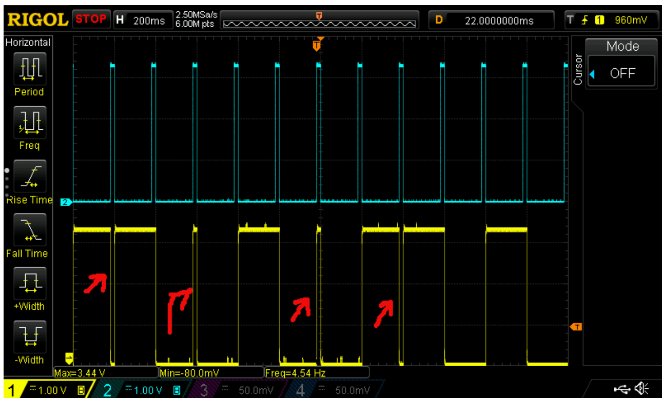
Illustration 3: Wrong generated Interrupts, generated not at falling edges. Blue: Interrupt input, Yellow: LED output

In the test a clean signal, coming directly out of a waveform generator was connected to the interrupt input. The rise-time of the pulse was set to 2ms. The figure below shows the wrongly generated interrupts at the rising edge (interrupt was configured to “FALLING”).