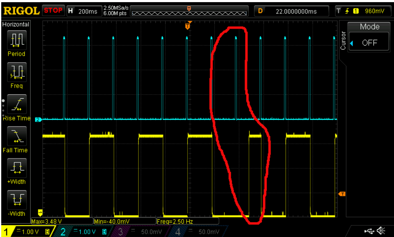
Illustration 2: Single Interrupts are not lost if hitting the device during ESP8266WiFiMult::run() . (Blue channel interrupt input, yellow channel LED output)